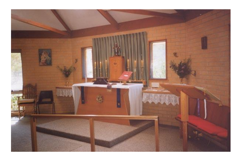
The Sanctuary of Saint Thomas' Church

The altar is on the Eastern wall of the church, with the tabernacle set into the rear wall. The windows on either side of the altar are designed by the Artist Margaret Woodward and are intended as a memorial to Gaynor Francis Vivian. Each Window contains within a wooden box frame three sheets of perspex on which are transparent abstract designs which contain Celtic and other symbols hidden within the design. They were mostly clear so as to allow colours from the garden plants outside allowing the garden to be an extension of the sacred space within.